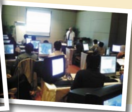
Kuala Lumpur, Malaysia